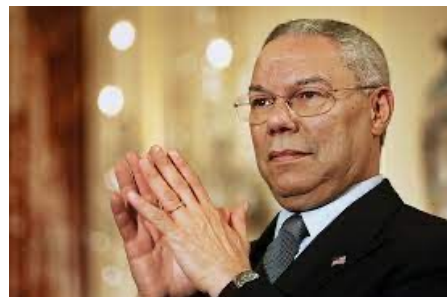
Colin Powell Born April 5, 1937 died October 18, 2021

During the week of October 10–October 16, there were 8,423 cases of COVID-19. 6,446 (76.5%) were unvaccinated and 1,977 (23.5%) were vaccine breakthrough cases. Source